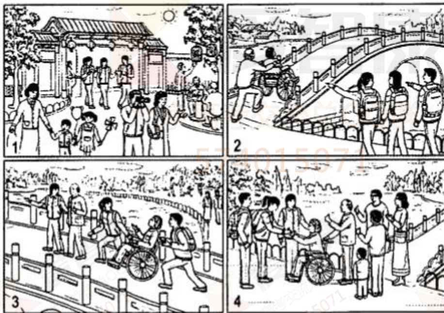
My Experience in the Park